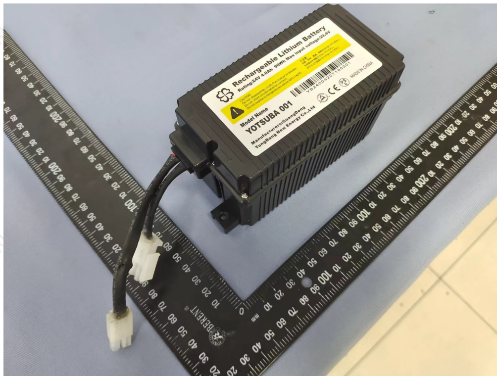
Figure 1 Overall view I of battery (外观图I)