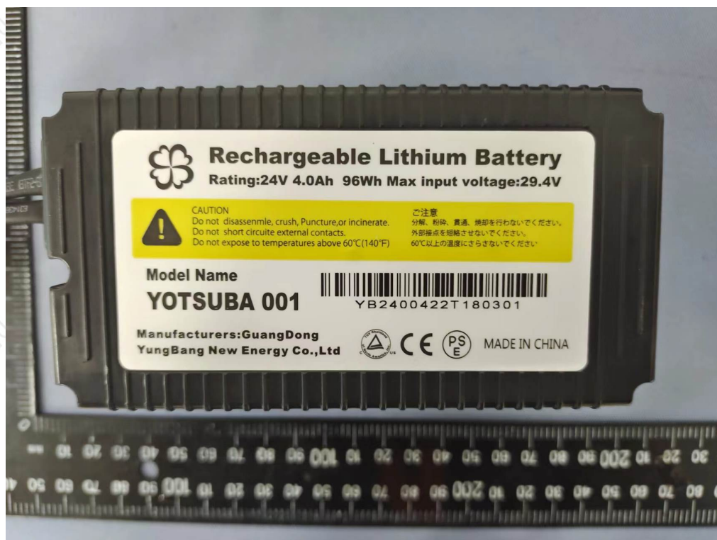
Figure 4 Battery label (电池标签)